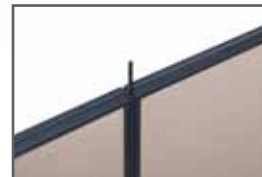
The Slide-In Extrusion Post creates 180° straight connection

The Universal Connector Post creates 90° "L" corners, 3-Way "T" corners and 4-Way "X" corners