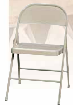
All-Steel Chair 16-1/4"D x 16-3/4"W x 29-1/4"H. Carton of 4. FC01LBG .....$121.00