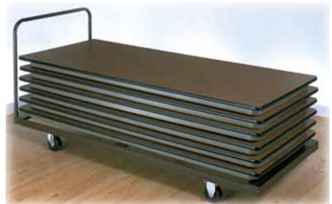
FOLDING TABLE TRUCK FTLT72BRN 30" x 74" .....$417.00 additional specifications: FTLT96BRN 30" x 97" .....$513.00 • 10 rectangular tables maximum amount recommended (FTL72/FTL96) • Available in Brown only