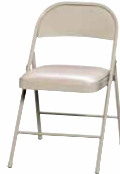
Chair with Padded Seat with 1" vinyl foam seat pad. Fire-retardant. 16-1/4"D x 16-3/4"W x 29-1/4"H. Carton of 4. FC02LBG .....$152.00

Light Beige tubular steel frame with four reinforced pivot points where the legs are fastened to the seat. Features wall-saver design, with extended rear legs, to prevent back from damaging wall. Non-marring polyethylene end caps are also slip-resistant. Available with matching padded seat and all-steel seat. Covered by The HON® Limited 5-year Warranty.